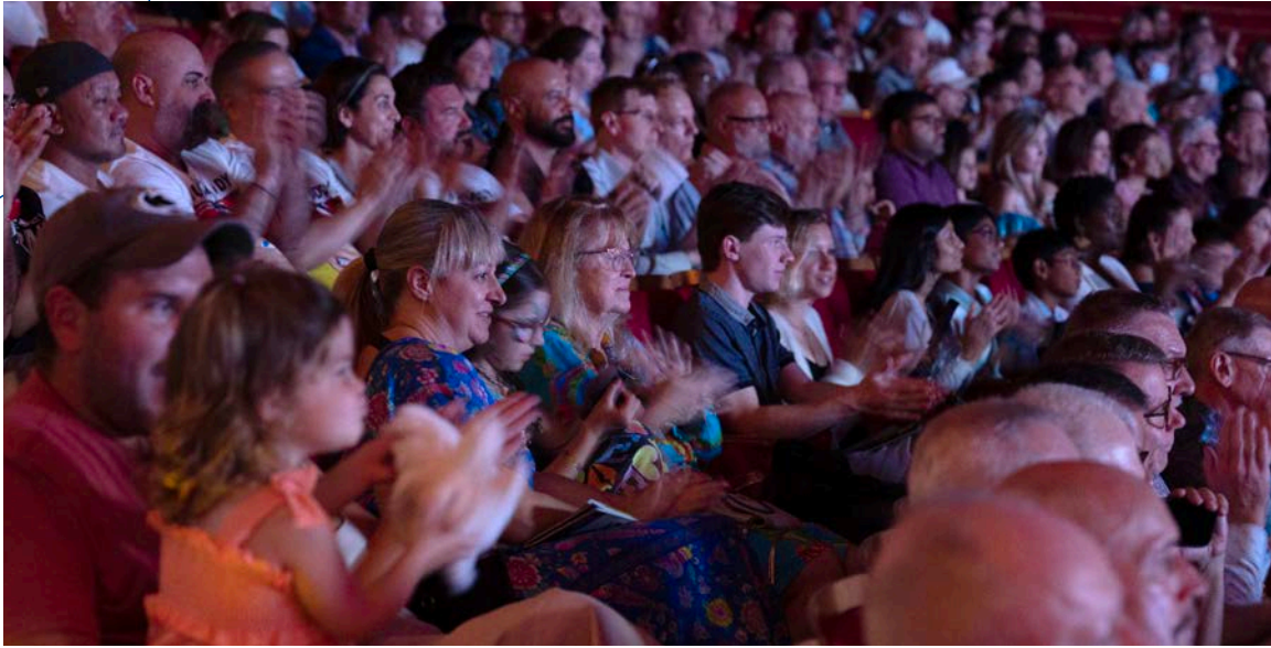
Audience members at the Gay Men's Chorus of South Florida's Disney PRIDE in Concert.