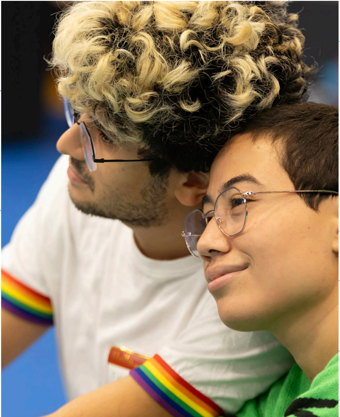
Attendees at AQUA Foundation's TransCon conference for South Florida's transgender and non-binary community.