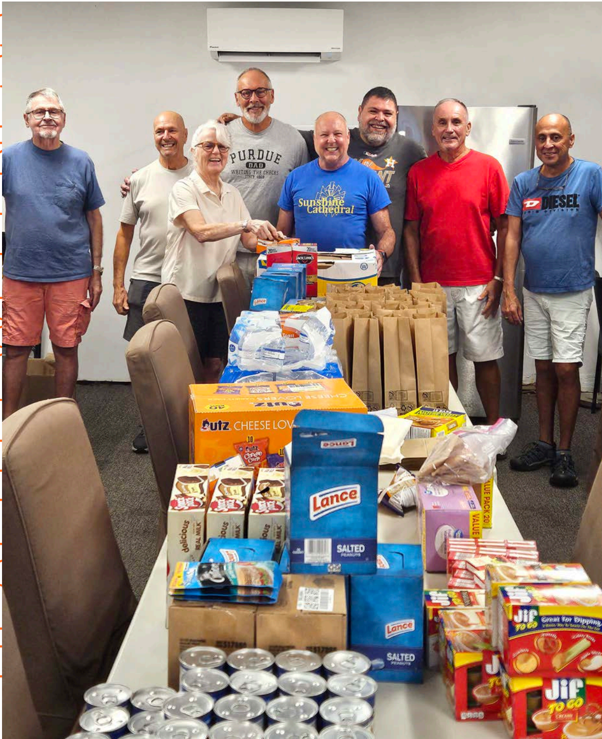
Volunteers preparing meals for Sunshine Cathedral's Brown Bag food distribution program.