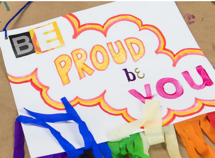
Artwork created at Miami Children's Museum's Rainbow Families Day.